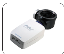
Firefly Digital Camera +Beam splitter

It's easy to upgrade your S360/S360s to a Digital Slit Lamp with Firefly Digital Module Kit (Firefly Digital Camera, Beam Splitter, MediView Software, USB Cable, Background Illumination Module)