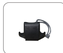
Background Illumination Module