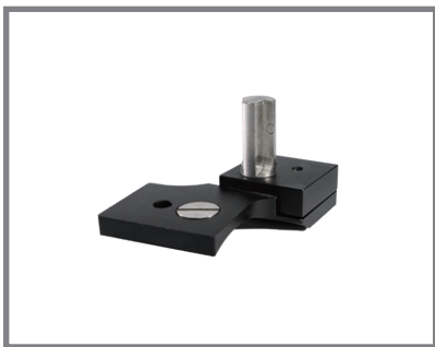
Tonometer Adaptor (Z type) (For Z type applanation tonometer)